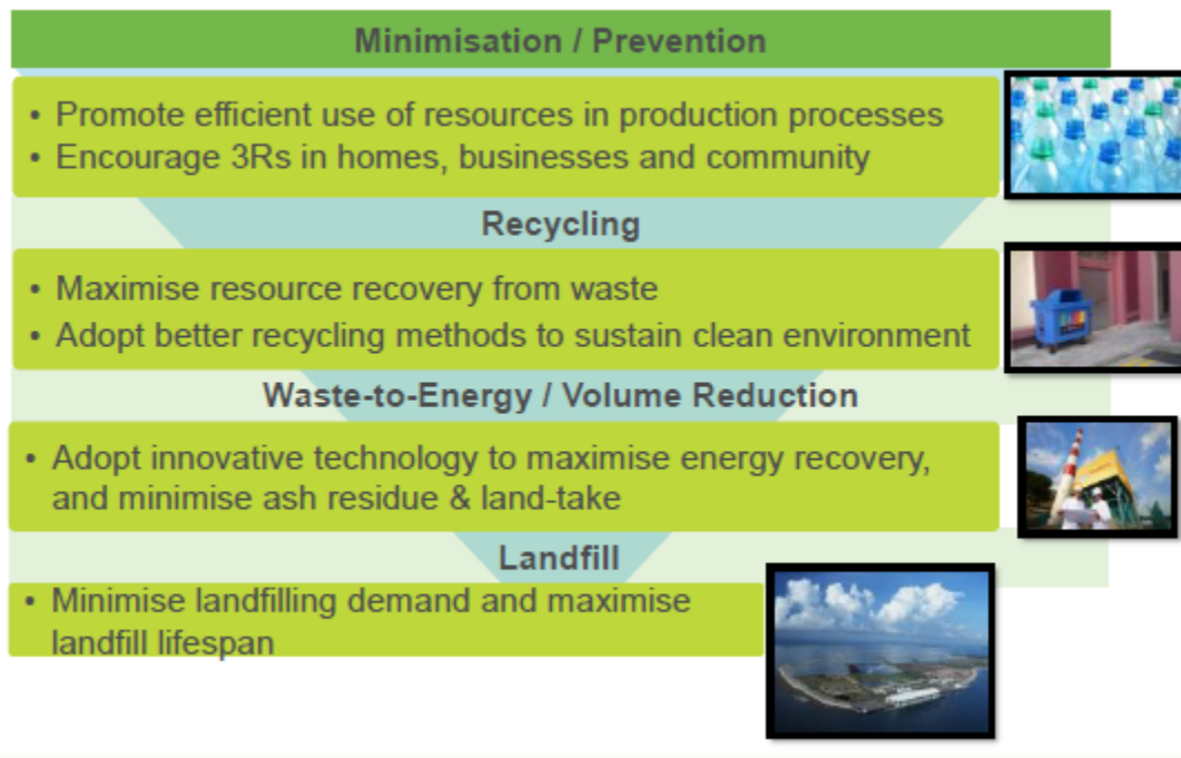
Fig. 1: The 3R Approach to Waste Management