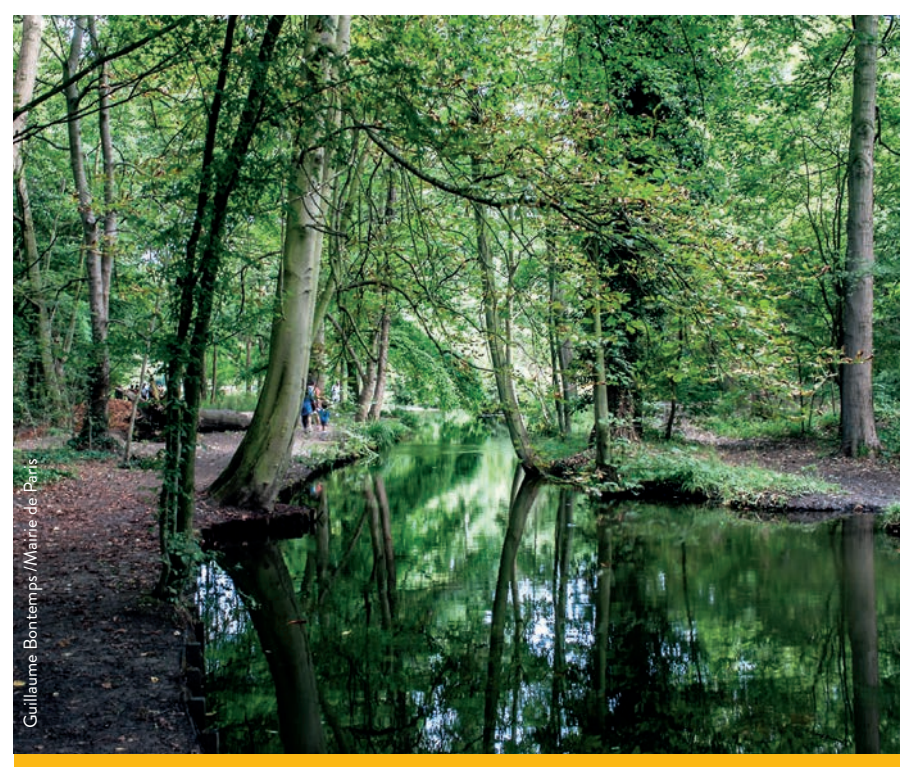
The wooded Parisian parks: large transition and adaptation zones for the fauna and flora moving closer to the heart of the metropolitan area, like here in the Bois de Vincennes.

Paris is richly endowed with two forests of regional importance and fourteen biodiversity reserves . These green spaces include various habitats and serve as a refuge, a food source and breeding grounds to many species. They must be preserved and reinforced throughout the area