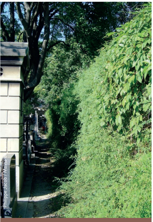
Paris cemeteries: unsuspected havens of biodiversity, like here at the Cimetière du Père-Lachaise, the largest nature oasis inside of Paris.

These nature zones are connected by ecological corridors that allow species to move from one sector to another and recolonize territories. In Paris, these corridors exist in many forms: the Seine, canals and their banks, tree alignments alongthe streets, the Forêt linéaire tree alinements, the Petite ceinture railway, as well as a mosaic of interconnected green spaces and diversified habitats.