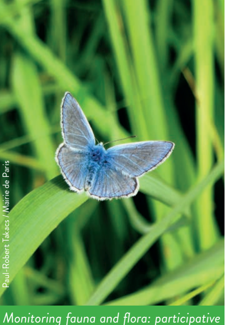
Monitoring fauna and flora: participative scientific approaches open to all