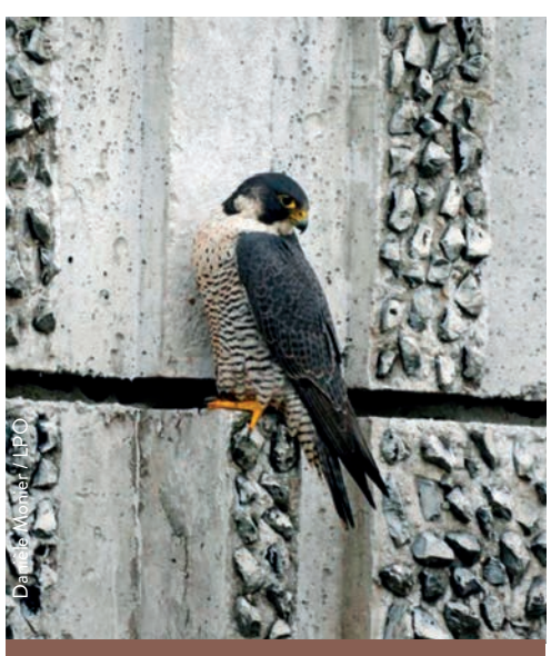
The peregrine falcon: a new species that has been seen nesting in Paris since 2010.