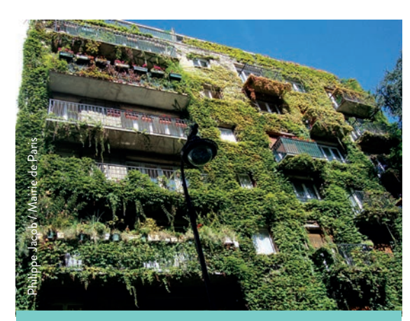
Green roofs and facades: urban ecological continuity promotes biodiversity and adaptation to climate change.